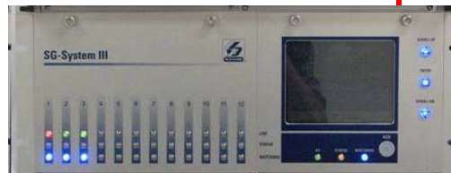
DSC Security Panels

We are always adding to the library of protocols and can add yours.