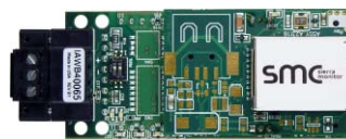
FFP-485 RS-485 Protocol Translation