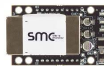
FFP-ETH Ethernet Protocol Translation